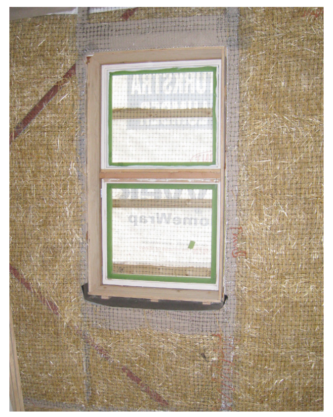
Photograph 3: Window framing (with subsill flashing), shear bracing and wire mesh reinforcement. This wall is ready for plaster.

Mesh reinforced cement-lime based stucco will typically have compressive strengths of 15 to 35 MPa (2000 to 5000 psi) and equivalent tensile strengths of 0.2 to 0.7 MPa (20 to 100 psi), depending on the quality and quantity of wire mesh reinforcing. The stiffness of such stucco is in the range of 10 000 to 25 000 MPa (1.4 to 3.6 x 10<sup>6</sup> psi).