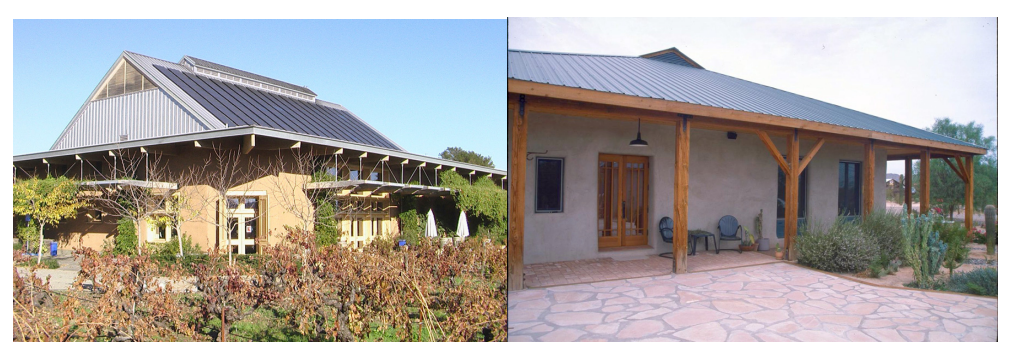
Photographs 4 and 5: Generous roof overhangs provide shading and shelter for these strawbale buildings

The use of sheet barriers to liquid and vapour movement is always a double-edged sword – the barrier that prevents wetting also slows drying. These types of barriers are likely to cause the very problems they are intended to solve in strawbale construction and should be avoided. Both practical experience and building science provides ample evidence to support this approach.