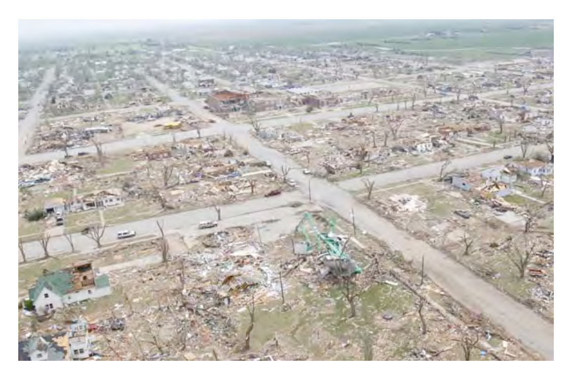
Figure 1.1: Aerial Photograph of Tornado Damage at Greensburg, KS

Building Science Corporation (BSC), a research team working with DOE's Building America program, was contracted to provide example house plans, support for the reconstruction of energy efficient houses and training for builders and trades.