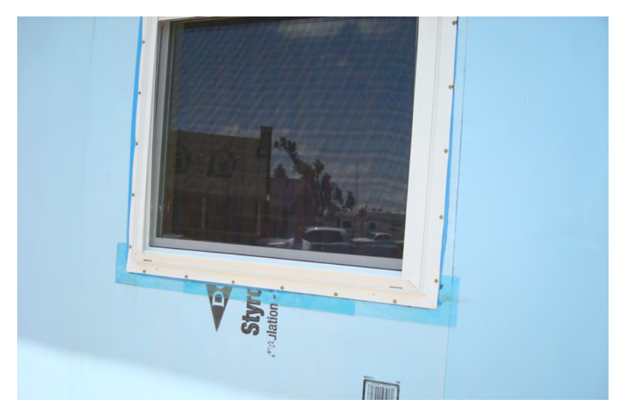
Figure 3.4: Photograph of partially complete window flashing

The second session was focused on water management details, including: window flashing and installation, window to wall interface, garage wall to house wall interface, and gable ends of the building.