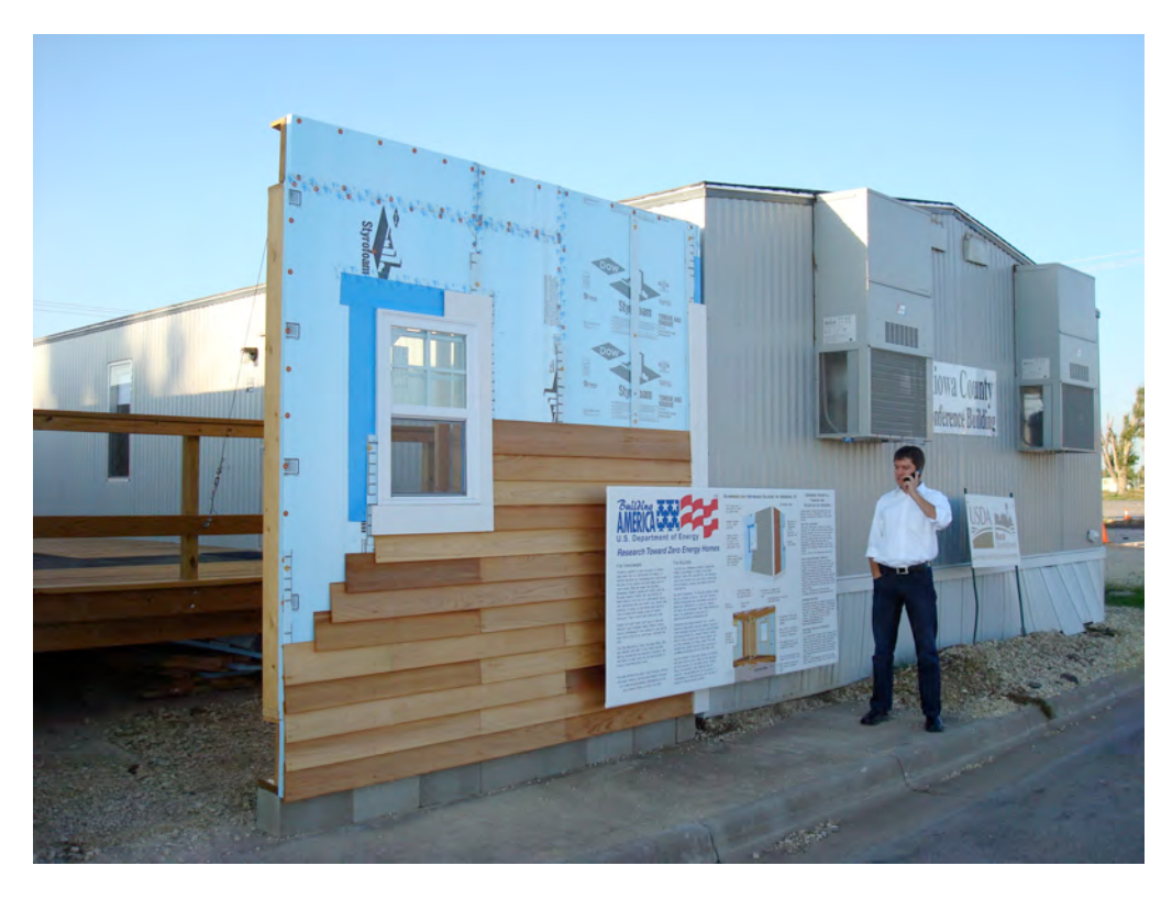
Figure 4.2: Photograph of completed wall mock-up with sign board near USDA office

The mock-up construction showed 2x6 advanced frame construction with 1.5" insulating sheathing detailed as the drainage plane (see Figure 4.2 above). A window was included to show proper flashing details and the siding and trim were installed as a "cut away" so that the installation and assembly could be seen without explanation. The construction of the mock-up was completed by BSC staff between Wednesday, September 19 and Saturday, September 22, 2007.