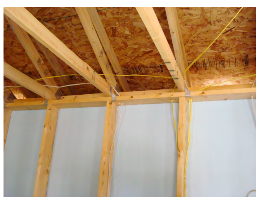
Figure 3.3: Photograph of advanced framing showing single top plate and insulating sheathing

For the first session, Joe focused on the advanced framing details. At the time of the site walk, two houses were at the framing stage and served as examples for the information session.