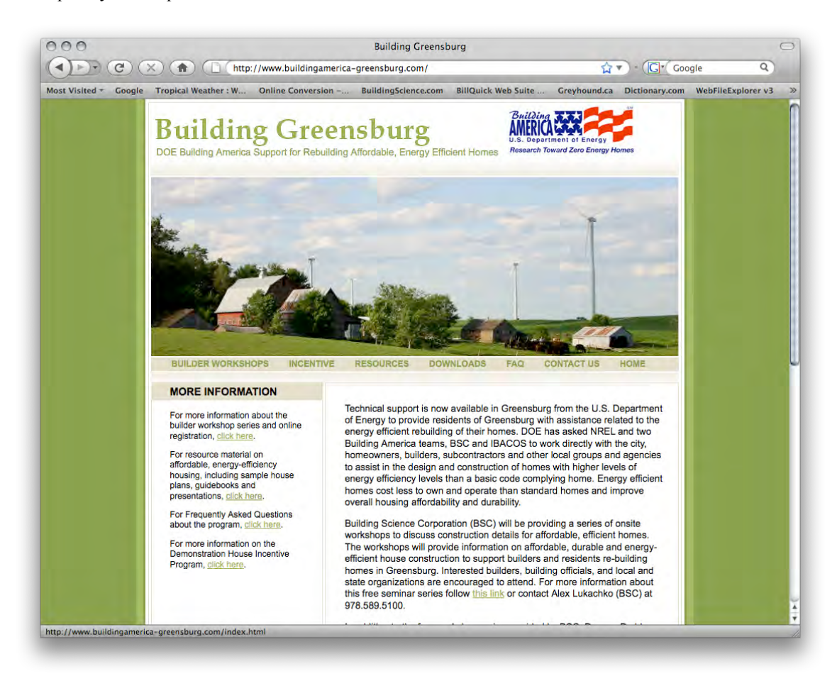
Figure 4.1: Screen capture of Building Greensburg website (www.buildingamerica-greensburg.com)

To complement this effort, BSC revised the "Building Greensburg" website (see Figure 4.1 below) to include additional resources intended for training builders. Based on feedback from builders, other stakeholders and our partners at IBACOS working in Greensburg, BSC also posted a number of responses to frequently asked questions. These resources are described in section 4.2 below.