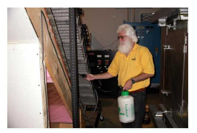
Figure 2c: Roof wetting