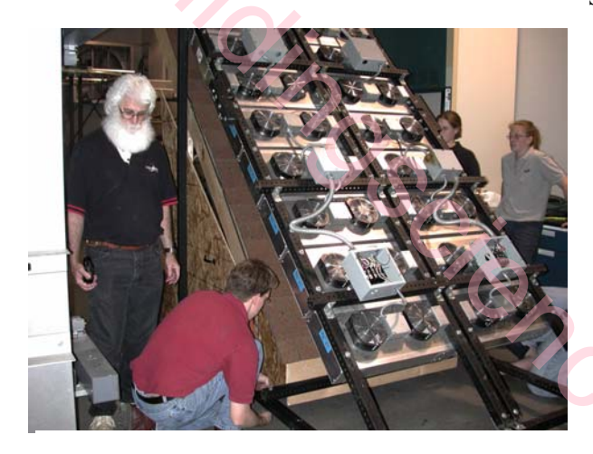
Figure 2b: Roof with solar array

Building Science Consortium partner Advanced Energy Corporation (AEC) reproduced the phenomenon of solar driven moisture in the laboratory. AEC constructed a mockup of a roof assembly with the insulation installed directly under the roof sheathing. An array of lights provided the solar heating. Wetting of the shingles followed by heating increased moisture in the insulated cavity. Turning off the heat lamps led to rapid cooling (the testing facility is air-conditioned) and condensation. AEC's roof mockup is shown in Figure 2a – 2d.