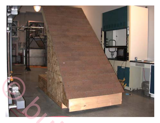
Figure 2a: Roof with shingles

Architecture and Building Science 70 Main Street P: 978.589.5100 Westford, MA 01886 F: 978.589.5103 www.buildingscience.com