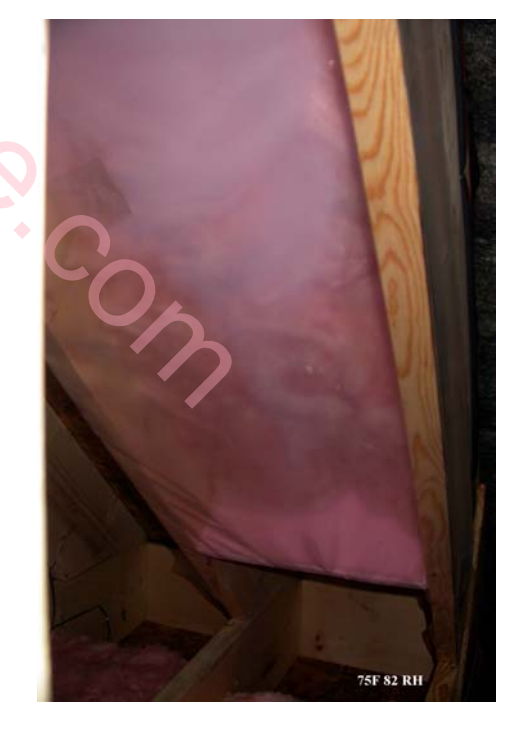
Figure 2d: Roof insulation