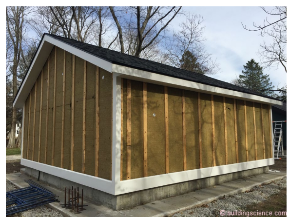
Photograph 3: Mineral Wool Board Insulation — The insulation boards installed on the exterior of framing can act as the thermal control layer...but they need to be coupled with a water control layer, air control layer and vapor control layer...mineral wool board insulation can do only one of the control layers.

and act as the water control layer, air control layer, vapor control layer and thermal control layer....all four control layers.