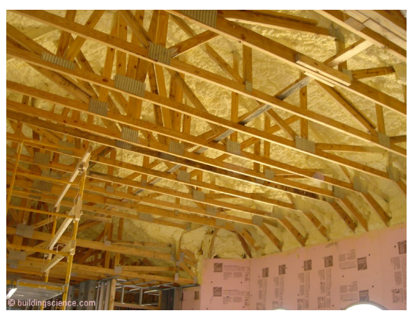
Photograph 8: Open Cell Spray Polyurethane Foam (ocSFP) - When you spray ocSPF into wall cavities from the interior the ocSPF can act as the air control layer and thermal control layer. It can't act as the vapor control layer – it is too vapor open. This is a problem when you spray ocSPF on the underside of roof/attic assemblies you can end up with problems ("Ping Pong Water").

When you spray ccSPF into wall cavities from the interior the ccSPF can act as the air control layer, vapor control layer and thermal control layer ("BSI-116: Interior Spray Foam", April 2020). When you spray ocSPF into wall cavities from the interior the ocSPF can act as the air control layer and thermal control layer. It can't act as the vapor control layer - it is too vapor open. This is a problem when you spray ocSPF on the underside of roof/attic assemblies (Photograph 8) you can end up with problems ("BSI-016: Ping Pong Water and the Chemical Engineer", October 2016). Water vapor from the interior passes up through the ocSPF and is stored in the wood based roof sheathing - and then driven out by solar radiation. In and then out...in and then out...a "ping" followed by a "pong" leading to an increase in moisture accumulating at the ridge (Figure 1)....requiring a means of moisture removal....either air supply and return from the house or a dehumidifier. Note that this also happens with fiberglass (Photograph 9), mineral wool and cellulose...all of these insulations also require either air supply and return from the house coupled with a "vapor diffusion port" or a dehumidifier ("BSI-088: Venting Vapor", July 2015). Further note that none of this is an issue with ccSPF. Let me repeat, none of this is an issue with ccSPF....because it is not vapor "open".