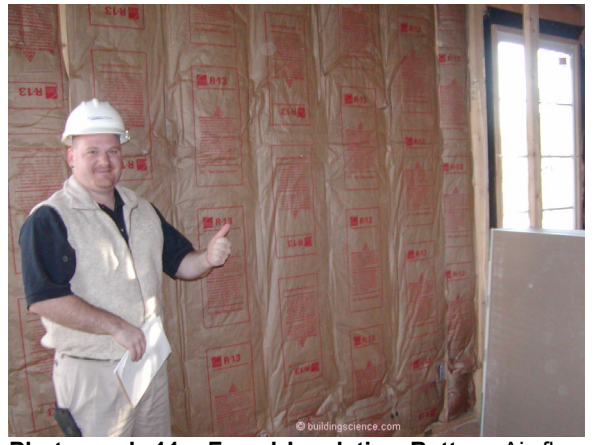
Photograph 11: Faced Insulation Batts – Air flow and convection can be effectively controlled by facers adhered to batt insulation. Note that faced insulation batts should have the facers installed to the "face" of the stud framing – not "inset stapled". Inset stapling creates voids and air channels that can lead to convective loops and a loss of thermal resistance.