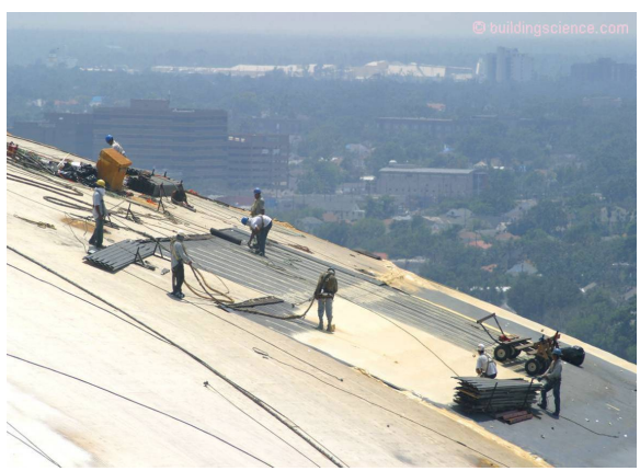
Photograph 7: Spray Polyurethane Foam Roofing – A fluid applied roofing membrane can be applied directly to the ccSPF. The Louisiana Superdome was successfully repaired with this approach after Hurricane Katrina.

Open cell, low density spray foam (ocSPF) if applied on the exterior of wall assemblies can't act as the water control layer – a fluid applied water control layer needs to be applied over its exterior surface.