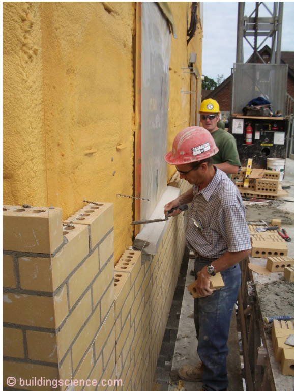
Photograph 6: Spray Polyurethane Foam - When you spray closed cell, high density spray polyurethane foam (ccSPF) on the exterior of gypsum sheathing or plywood or OSB it can act as the water control layer, air control layer, vapor control layer and thermal control layer....all four control layers