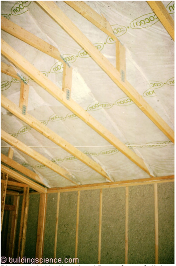
Photograph 12: Netted and Damp Spray Cellulose - They can only act as the thermal control layer. They can't act as the air control layer or the vapor control layer. Same with netted blown fiberglass.

How about cellulose...the netted and damp spray kind? They can only act as the thermal control layer (Photograph 12). They can't act as the air control layer – despite what folks say ("Don't be Dense With Insulation", ASHRAE Journal, August 2010). Same with netted blown fiberglass.