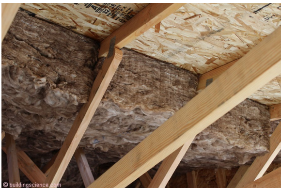
Photograph 9: Fiberglass and Mineral Wool and Cellulose Underside Roof Deck Insulation - Water vapor from the interior passes up through the vapor open insulation and is stored in the wood based roof sheathing – and then driven out by solar radiation. In and then out...in and then out...a "ping" followed by a "pong" leading to an increase in moisture accumulating at the ridge requiring a means of moisture removal.... either air supply and return from the house coupled with a "vapor diffusion port" or a dehumidifier

On to fiberglass and mineral wool batts installed in wall cavities, roof cavities, on the ceilings of attics or on the underside of roof/attic sheathing. They obviously can't act as the water control layer, the air control layer or the vapor control layer. They can act as the thermal control layer if airflow through them is limited or controlled (Photograph 10 and Photograph 11). We learned this with our "Thermal Metric Project" (see References). In fact, the Thermal Metric Project showed that all cavity insulations functioned if they were combined with air control layers and if convection was controlled (Figure 2). Let me be specific and obvious - if batts are installed and fitted "tightly" without voids they work ("BSI-089: WUFI-Barking Up the Wrong Tree?", November 2015).