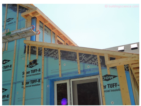
Photograph 1: Foil Faced Polyisocyanurate Boards – The rigid insulation boards are installed on the exterior of framing with their joints taped/sealed and act as the water control layer, air control layer, vapor control layer and thermal control layer....all four control layers.

Foil faced polyisocyanurate boards installed on the exterior of framing with their joints taped/sealed can act as the water control layer, air control layer, vapor control layer and thermal control layer....all four control layers (Photograph 1). So can extruded polystyrene (XPS) boards (Photograph 2).