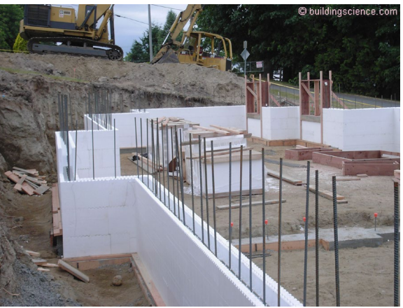
Photograph 5: Insulated Concrete Forms (ICF's) - They can act as the air control layer, vapor control layer and thermal control layer. They need to have a water control layer installed on their exterior or a cladding such as polymer based (PB) stucco directly attached to their exterior face creating a barrier wall mass assembly.

How about insulated concrete forms (ICF's)? They can act as the air control layer, vapor control layer and thermal control layer (Photograph 5). They need to have a water control layer installed on their exterior or a cladding such as polymer based (PB) stucco directly attached to their exterior face creating a barrier wall mass assembly ("BSI-040: High Rise Igloos", October 2010).