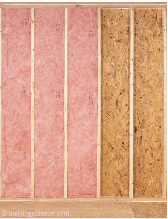
Photograph 10: Fiberglass and Mineral Wool Batts – When they are installed in wall cavities, roof cavities, on the ceilings of attics or on the underside of roof/attic sheathing they can't act as the water control layer, the air control layer or the vapor control layer. They can act as the thermal control layer if airflow through them is limited or controlled.

Additionally, in roof/attic applications wind-washing must be controlled ("BSI-064: Bobby Darin and Thermal Performance", October 2012).