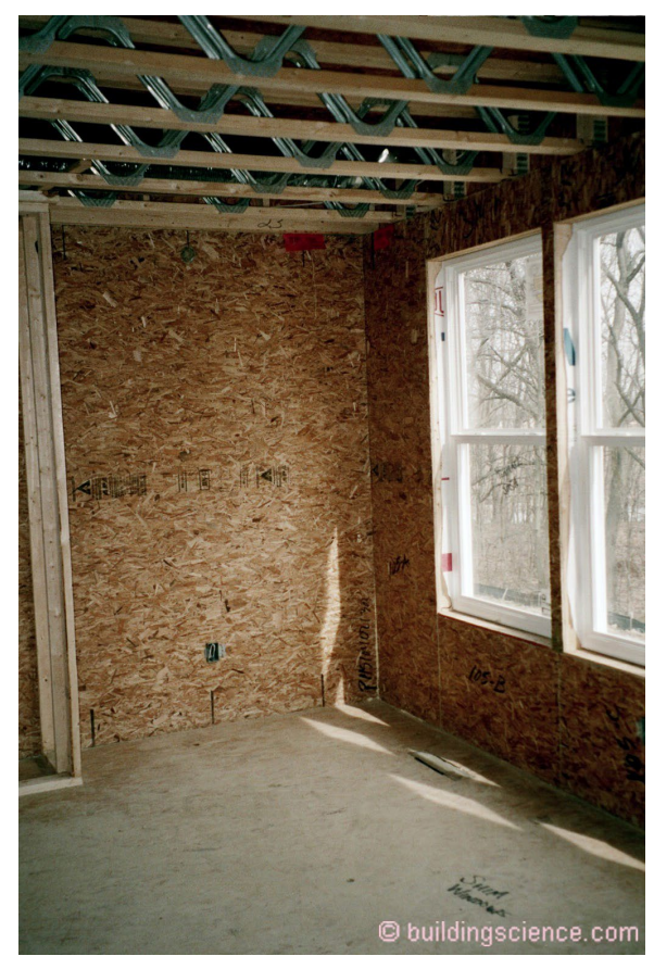
Photograph 4: Structural Insulated Panels (SIP's) - They can act as the air control layer, vapor control layer and thermal control layer but not the water control layer. They need to have a water control layer installed on their exterior.

How about insulated concrete forms (ICF's)? They can act as the air control layer, vapor control layer and thermal control layer (Photograph 5). They need to have a water control layer installed on their exterior or a cladding such as polymer based (PB) stucco directly attached to their exterior face creating a barrier wall mass assembly ("BSI-040: High Rise Igloos", October 2010).