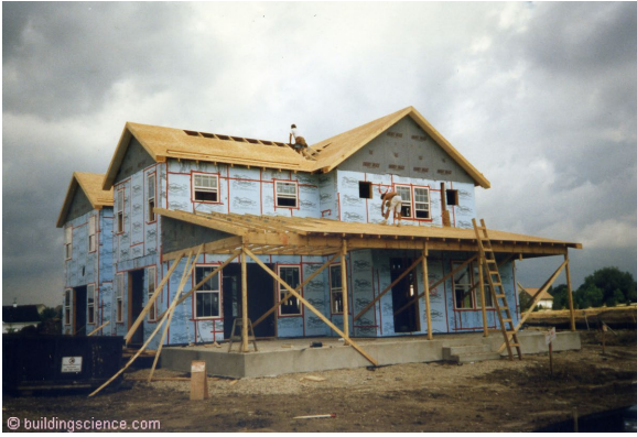
Photograph 2: Extruded Polystyrene (XPS) Boards - The rigid insulation boards are installed on the exterior of framing with their joints taped/sealed

and act as the water control layer, air control layer, vapor control layer and thermal control layer....all four control layers.