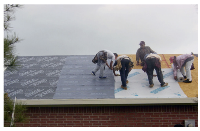
Photograph 2—Test Attic in Houston: To this day I am amazed at what builders are willing to do to figure stuff out. David Weekley Homes said "sure" we will let you have one of our garage attics for a year on one of our sales models if you figure out if stuff from outside is being driven inside. Hat tip to Mr. Weekley. I was worried that moisture from dew and rain would wick into the overlaps of asphalt shingles and be driven inwards by solar radiation and lead to increased moisture contents in roof sheathing—especially in unvented roof assemblies—turned out I was wrong.

supply and return to the attic space and be done with it. So how much air do you need to supply and return? Ah, that part is pretty easy—50 cfm for every 1,000 ft<sup>2</sup> or ceiling area. Where does this number come from? It is around 1/3 to 1/2 air changes per hour (ach) and it corresponds to our experience from the measurement of leaky ductwork using tracer gas back in the day (check out the references at the end of this column). It is also the same number we find in the model codes to condition "unvented crawl spaces" and crawl spaces are a lot more problematic that attic spaces—so we are starting with a very conservative flow rate.