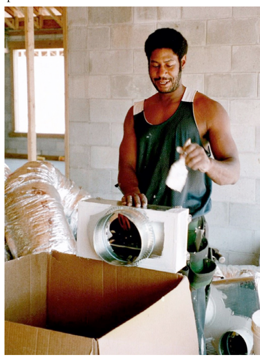
Photograph 1—Mastic Rules : I did not think I would live to see the day where mastic is used to seal all ductwork not just ductwork outside the conditioned space. Woo-hoo!

In what has become an amazing turn of events folks are figuring out how to construct tight ducts—even when they are located "inside". Mastic rules ( Photograph 1 ). All of this is good. The only place air should exit a duct or enter a duct is at a grille or register. So what is the problem?