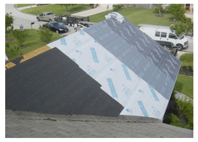
Photograph 3—Permeable and Impermeable Roofing Underlayments: Turned out that there was no measurable