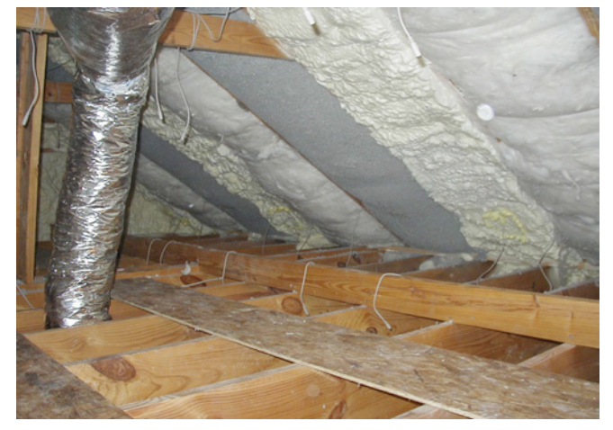
Photograph 4—Roof Deck Insulation Type: We looked at all of them. They responded differently to interior moisture but did not respond differently to exterior moisture. There was no measurable exterior moisture effect.

But now we get into a real can of worms. But only if we choose the "add both a supply and return to the attic" approach. Huh? No worms with just a supply and a leaky ceiling. The leaky ceiling does not crop up in code world. What does crop up in code world is stuff that burns and is plastic. The most common way of constructing a conditioned attic is to spray low-density or high-density