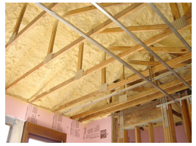
Photograph 5—Low-Density Open-Cell Spray Polyurethane Foam: It is very vapor open—around 30 perms per inch of thickness—and will allow moisture from the interior to pass through it and migrate to the underside of the roof deck. This is not typically a problem as solar radiation drives this moisture back down out of the foam and back into the attic space air where it is usually removed by air change created by leaky ducts.