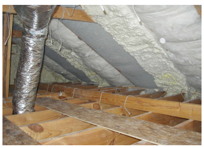
Photograph 4—Roof Deck Insulation Type: We looked at all of them. They responded differently to interior moisture but did not respond differently to exterior moisture. There was no measurable exterior moisture effect.

But now we get into a real can of worms. But only if we choose the "add both a supply and return to the attic" approach. Huh? No worms with just a supply and a leaky ceiling. The leaky ceiling does not crop up in code world. What does crop up in code world is stuff that burns and is plastic. The most common way of constructing a conditioned attic is to spray low-density or high-density