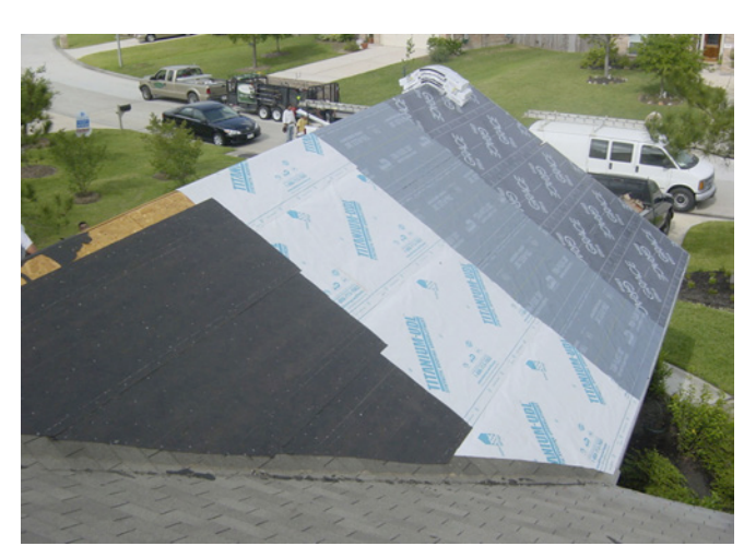
Photograph 3—Permeable and Impermeable Roofing Underlayments: Turned out that there was no measurable

Photograph 2—Test Attic in Houston: To this day I am amazed at what builders are willing to do to figure stuff out. David Weekley Homes said "sure" we will let you have one of our garage attics for a year on one of our sales models if you figure out if stuff from outside is being driven inside. Hat tip to Mr. Weekley. I was worried that moisture from dew and rain would wick into the overlaps of asphalt shingles and be driven inwards by solar radiation and lead to increased moisture contents in roof sheathing—especially in unvented roof assemblies—turned out I was wrong.