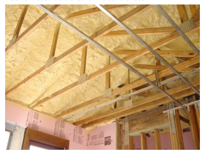
Photograph 5—Low-Density Open-Cell Spray Polyure-thane Foam: It is very vapor open—around 30 perms per inch of thickness—and will allow moisture from the interior to pass through it and migrate to the underside of the roof deck. This is not typically a problem as solar radiation drives this moisture back down out of the foam and back into the attic space air where it is usually removed by air change created by leaky ducts.