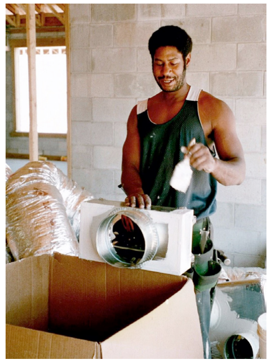
Photograph 1—Mastic Rules : I did not think I would live to see the day where mastic is used to seal all ductwork not just ductwork outside the conditioned space. Woo-hoo!

In what has become an amazing turn of events folks are figuring out how to construct tight ducts—even when they are located "inside". Mastic rules ( Photograph 1). All of this is good. The only place air should exit a duct or enter a duct is at a grille or register. So what is the problem?