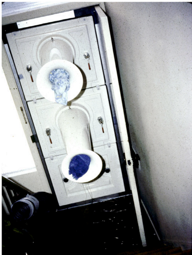
Photograph 2: Blower Door Test —Early days of testing. A two huge fans shown here actually sucking my Mom and Dad right out of the house.

We were not done. Blew foam over the entire attic. Two inches of 2 lb. density spray polyurethane foam right over the plaster ceiling. Then blew 12 inches of loose fill fiberglass over the foam. Yup, a super insulated R-55 attic ceiling and an air tight attic ceiling. Added attic ventilation—got that part right at least. Got Tony Woods 3 to do the air test before and after ( Photograph 2 ). Went from 11 ach@50 down to 3 ach@50. This was a 1,100 ft 2 house with a basement. This was really, really good. Did I mention that this was 1980?