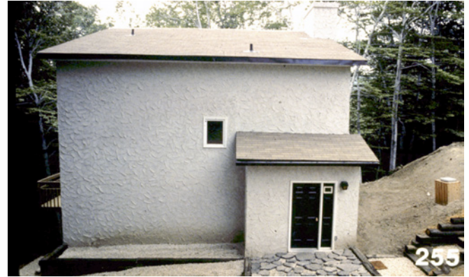
Photograph 7: More Earth Tubes —Note the small wood box off to the side of the house on the hill. That is the intake location for the earth tubes. I got an award for what is probably the ugliest house ever built in Ontario. There is a reason we don’t let engineers do architecture. Yes that is the only window on the north side. No windows on the east and west. Lots of windows on the south.

7). Got them built and up and running in late fall. The earth tubes worked great through the winter if you believed the temperature measurements I took in the air streams. Man, I was a hero.