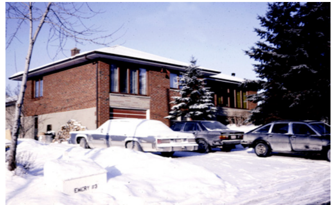
Photograph 1: Mom and Dad’s House —Small house in Downsview, ON with triple glazed casement windows and a super insulated vented attic with an airtight ceiling.

I am going to talk about some stupid stuff I have done. Be gentle with me. The list of stupid stuff covered is only a partial list. A complete accounting of stupid stuff I have done would fill a book. And yes, the stupid stuff covered really did happen. There is no way to make this stuff up.