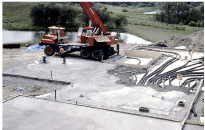
Photograph 11: Crane —Getting it done no matter what.

Now comes the fun part. Placing the concrete. It was a Sunday morning. Who works on a Sunday morning placing concrete? Only someone who is behind on the schedule. Placed the concrete for the garage slab first. Easy. No ducts in that slab. Should have quit then. Started placing the concrete for the main slab. The ducts floated. Ah man. Had to tie the dam things to the mesh reinforcing ( Photograph 10 ). Took over an hour. Did I mention the concrete trucks were there waiting? Had to slow down the setting time of the mix. Needed an admixture. Did I mention this was a Sunday morning? Then we couldn’t get the concrete over the ducts without crushing them and we couldn’t drive the concrete trucks