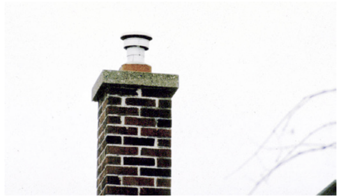
Photograph 5: Flue Liner —Warming the chimney using a flue liner to reduce the size of the flue and reduce the heat loss through the chimney. This increased the temperature of the flue gases and the theoretical draft.

First thing we did was warm up the chimney. We put in a flue liner which reduced the size of the flue and reduced the heat loss through the chimney ( Photograph 5 ). This increased the temperature of the flue gases and the theoretical draft so that should have been the end of it right? Nope. Still had spillage and backdrafting. Couldn't figure out why until we could measure pressures accurately—down to a Pascal. It was sure nice to be at a university with older engineers running around who knew how to measure things. Once we got the measurements right the “pressure triggers” became obvious. The furnace itself was the culprit. More precisely, the big fan (“blower”) in the furnace did the damage coupled with an unbalanced duct distribution system and leaky returns all inside of what was now a “tight” house. We got the ducts right by making them tight—no more panned floor joists or stud cavities for returns—and then making sure the duct system was fully balanced on the supply and return side. We “invented” transfer grills and jump ducts to balance the pressures and handle the opening and closing of interior doors. All this is old news today, but it sure wasn't old news in 1982.