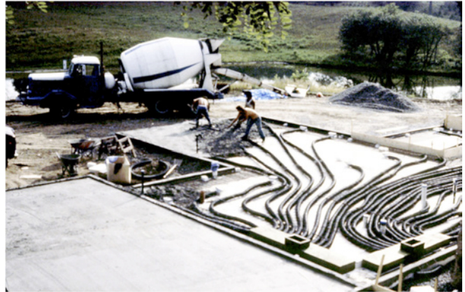
Photograph 10: Concrete Truck Follies —Sunday morning yielding floating ducts.

But where to put the ductwork? That’s why God invented basements...a place to put the ductwork. Can’t put the ductwork in the attic. That would be really, really dumb. Easy, put it in the slab. I was already in love with long coiled plastic drainage pipe so the solution was obvious ( Photograph 9 ).