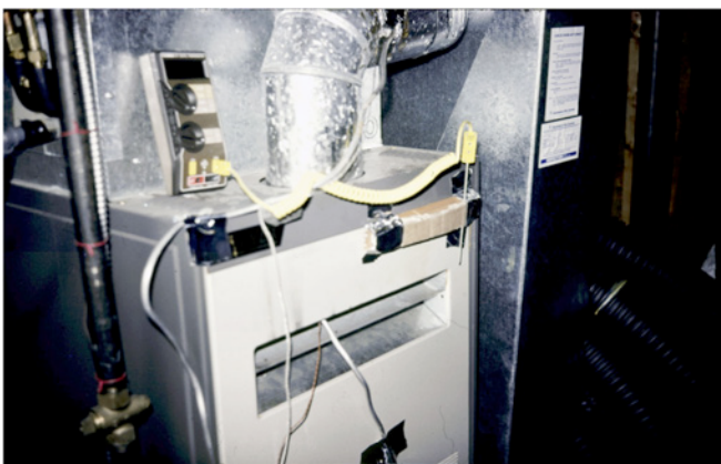
Photograph 4: Signs of Spillage —The tell-tale soot markings indicative of spillage and backdrafting of products of combustion.