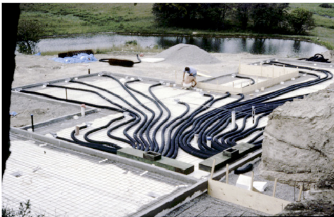
Photograph 9: Ductwork in the Slab —Long coiled plastic drainage pipe was used for the in slab ductwork. Note the fiberglass reinforced polymer modified cement “gluing” the foam formwork together.

I got the bright idea to float a concrete slab on top of a bunch of foam ( Photograph 8 ). I could use the foam to be the “formwork” for the slab and leave it in place. I would “glue” the foam together with fiberglass reinforced polymer modified cement. Yes, an EIFS 9 slab on grade.