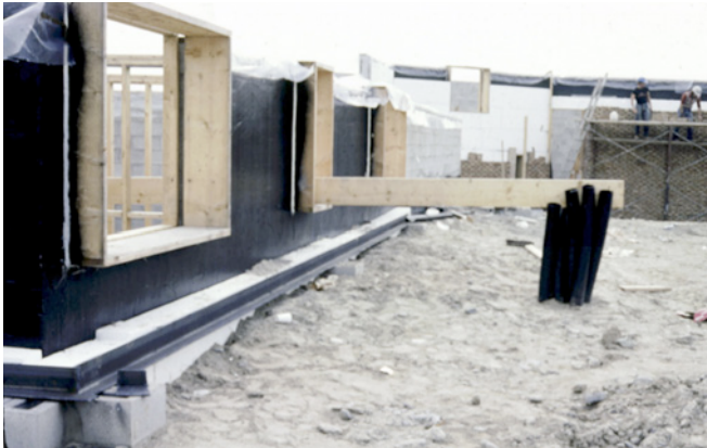
Photograph 6: Earth Tubes —Note the plastic drain pipes sticking out of the ground. Each pipe was 50 feet in length and connected to the intake side of a heat recovery ventilator.

It is hard to imagine that I used to be a custom homebuilder in the early days. I was building tight and ventilating right with balanced heat recovery ventilation. I was conditioning interiors with sealed combustion power vented appliances. I was heating water with electricity because there were no sealed combustion or power vented domestic hot water systems in the early 80’s. The Mom and Dad lesson stuck. But then I got cocky. Yup, it happens. Only took a year. I pretty much knew it all by the time I was 27.