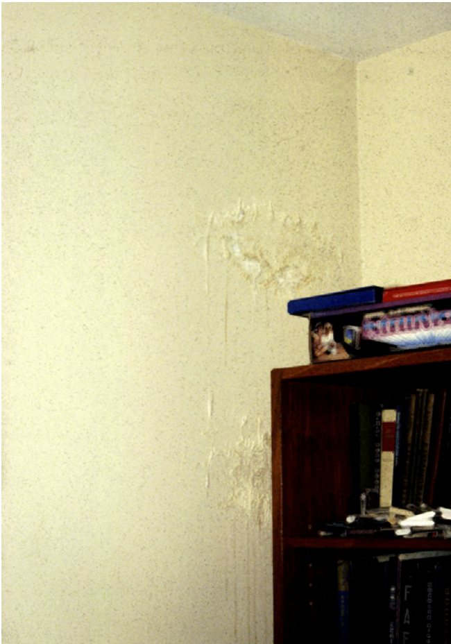
Photograph 3: My Room —The condensate began to leach through the exterior wall to the interior and damage the plaster. But no one could see it because it was occurring behind a bookcase. This was occurring in my old room. My room. Not my brother's old room. My room.