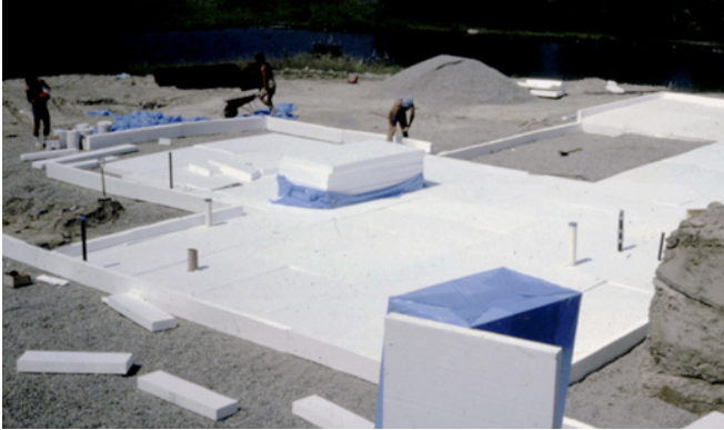
Photograph 8: Foam Formwork —Float a concrete slab on top of a bunch of foam using the foam to be the “formwork” for the slab and leave it in place.

I thought basements were a dumb idea when I was a builder. Why dig a big hole and put a building into it. You have to keep the dirt out of it, the water out of it, the soil gas out of it. You get the idea. Why not build on top of the ground. I was fascinated by slabs on grade. Of course they had to be insulated. Super insulated. And I was the man to do it.