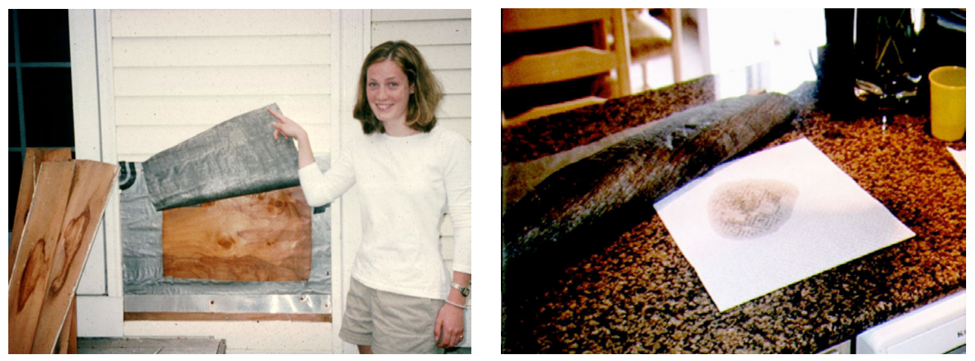
Photograph 7 (above left) - Joe Test 1 in 1995: It was not very predictive with new materials but pretty conclusive with field failures. That is my daughter helping me out. Photograph 8 (above right) – Failed Material: Weathering it seems was also important. Stuff seemed to be getting on to the stuff changing things . . .

Tar paper starts with a bunch of cellulose fibers that are smushed together so that the gaps between them are about the size of water basketballs. The fibers are then coated with bitumen that makes the gaps smaller than