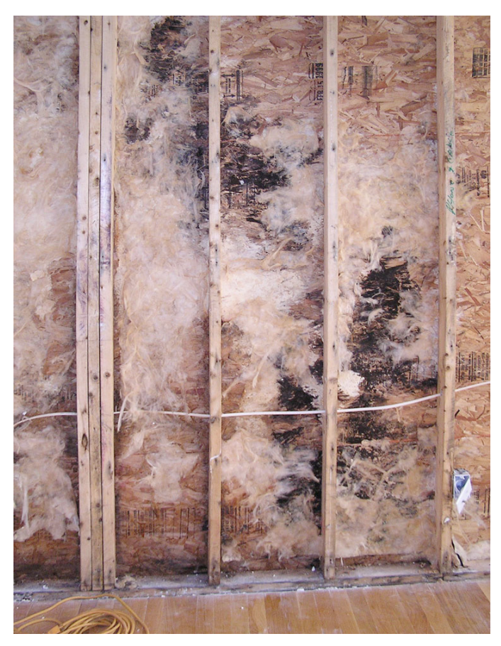
out there and these big wide roll products that let you tape them have a lot going for them.

So what is wrong with tar paper? It has some pretty neat characteristics. It does not pass liquid water (except at nail holes and staple holes) and it does pass vapor water. Vapor permeable and hydrophobic. But it is tough to work with. It comes in narrow rolls, it blows off easily and it is really difficult to tape it or seal it unless you mastic it. Your only good strategy is to lap it shingle fashion and give up on high levels of airtightness. Now you can achieve airtightness other ways. And many old folks love the stuff and believe me, I revere the old folks. The old folks say, suck it up and demand good workmanship and stick with the tar paper and put it up with cap nails and stop whining and make something else the air control layer. Yeah, but, it is getting really difficult