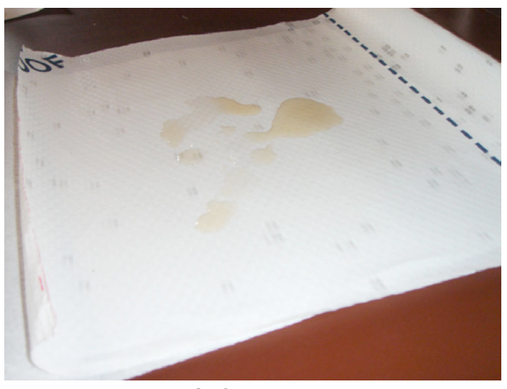
Photograph 12 – Weak Surfactant: Use a teaspoon to drop this weak surfactant solution on the sample. This is Joe Test 3.

Tests. All the ones that I have tested this way fail Joe Test 3 and Joe Test 4. The polymeric fibrous, the non-porous permeable film and micro-porous film products all pass the four Joe Tests along with old fashioned tarpaper.