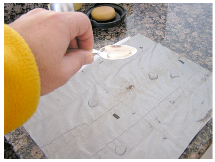
Photograph 10 – Wood Sugars and Tannins: I began to notice that when I held failed housewraps up to the light they were darker in some spots than others. They would fail Joe Test 1 in the dark stained areas and pass Joe Test 1 in the non-dark areas. It became very obvious with lighter colored housewraps. What caused the discoloration? That part was easy. Wood sugars and tannins. Water-soluble extractives. "Weak" surfactants by another name.

So what is Joe Test 4? Ah, if the product sample passes Joe Test 3 let the water evaporate leaving a stain on the surface. Wait for the stain to dry. Then add a droplet of water to the dry stain and see what happens. Joe Test 3 involves the surface energy of the liquid. Joe Test 4 involves the surface energy of the surface.