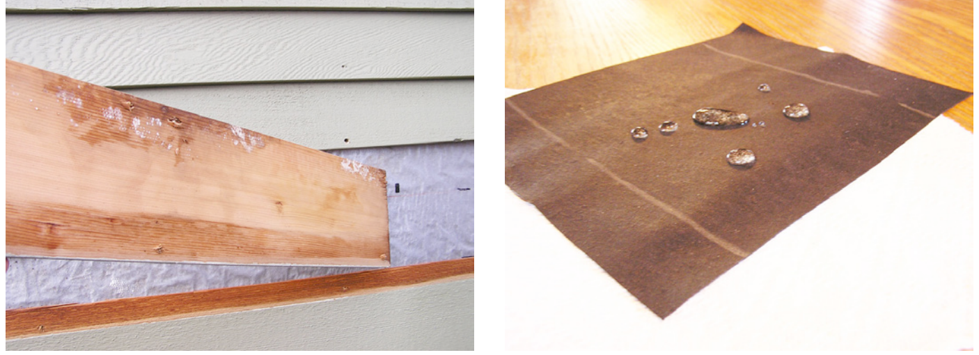
Photograph 3 (top left) – Wet Siding: Water that used to drain and not be absorbed now passes through the field of the building paper and is absorbed. More water is now retained for a longer period of time. Photograph 4 (top right) - Tar Paper Test: A teaspoon of water is placed on tar paper placed over a paper towel. Look at how the water beads up on the surface. A beautiful sight.

Water in the vapor form hangs out as individual molecules. Water in the liquid form clumps together in groups of 25 to 75 molecules. The "clumps" are bigger than the individual molecules. Think "golf balls" and "basketballs." The golf balls are the vapor and the