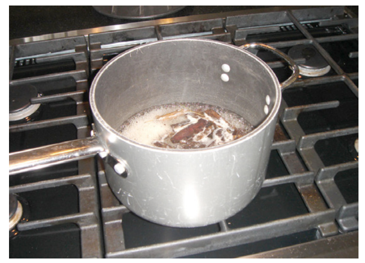
Photograph 11 – Boiling Water and Mulch: This should not be done at home without adult supervision. Take a half dozen cedar chips ("mulch") and boil in water for 30 minutes and allow to cool to room temperature.

To my knowledge no product that has passed the four Joe Tests has failed in the field. To my knowledge no mechanically perforated product has passed the four Joe