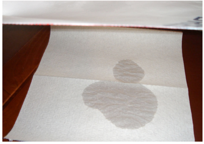
Photograph 13 – Wet Spot: Failure is pretty dramatic when it happens. It should fail in less than 60 minutes if it is going to fail. The water solution just stays there for a long while and nothing happens. Then, all of a sudden, it goes through. More exciting than watching paint dry.

passes this enormous stress after a couple of minutes you are good to go. If the product fails take a valium and do the longer test as you pretty much beat the crap out the product. I mean who would ever spray soap and water on his wall? Amazing as it seems, folks like to power wash their siding with soap and water and sometimes even bleach. Wow. Why don't you just take a gun and shoot yourself. This is very, very bad.