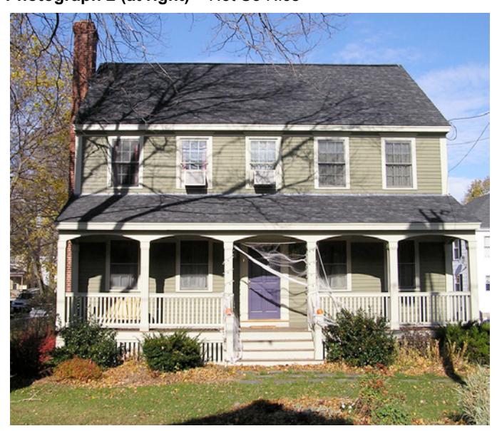
Photograph 1 (bottom left) – Nice House Photograph 2 (at right) – Not So Nice

Building paper ultimately evolved into a key element of the water control system of the wall assembly. Lapped shingle fashion and integrated with punched openings became the norm. Not perfectly water tight, but good enough for the time. Not perfectly air tight, but good enough for the time. Being located on the outside of the frame assembly, with the insulation inside the frame assembly meant the building paper had to "breathe." Boy do I hate that term, but that is what we called it in many parts of North America – "breather paper." How much did it have to breathe? Depends. Most of the folks say more than 5 perms less than 100. It is a Goldilocks thing. Not too vapor open and not too vapor closed. Traditional tar paper operated between 2 perms and 80