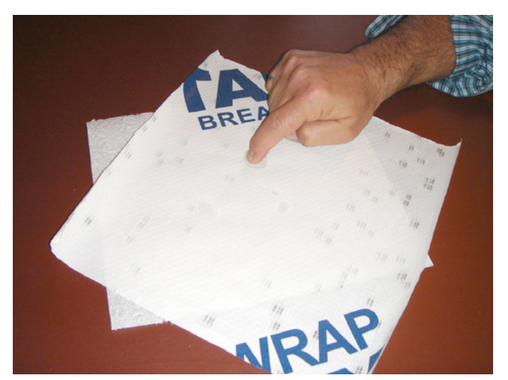
Photograph 9 – Tent Test: Breaking the surface tension to wet the surface. Joe Test 2.