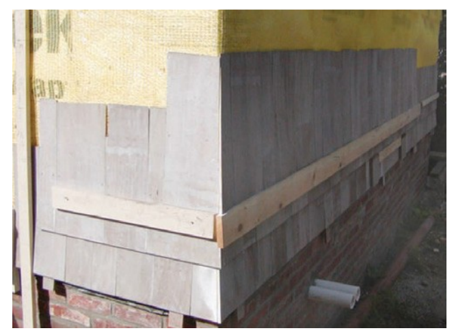
Photograph 5: Drainage and Ventilation Matt Behind Cladding—This is easy for new construction and recladding. Existing buildings are going to be a problem. Don't say you weren't warned.

heat (energy) has to be added back to the air. Traditionally this heat (energy) was available through