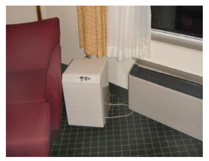
Photograph 6: Hotel Room Fix —The through-wall unit controls the temperature (the "sensible" system). The dehumidifier controls the humidity (the "latent" system).

Guess where this technology is now making an impact condos and apartments. Small houses are next. We are already separating the latent from the sensible on most commercial design—after all it is the sensible thing to do.