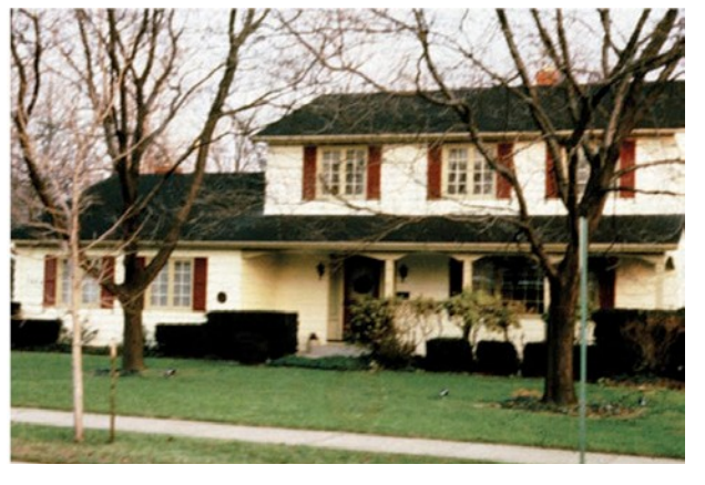
Photograph 1: The "Typical House" —Built in 1965 in Cleveland, OH with no cavity insulation in the exterior wood frame walls. No problems for twenty years. Insulation added to exterior walls in 1985 and within one year the paint begins to fail.

When my Mom and Dad bought their first house in Toronto, Canada in 1957 there was no insulation in the walls and the house was leaky to air—it had a high air change driven by a traditional chimney. We lived in a 1,200 square foot house and in January, when the outside temperature dropped to 0 degrees F., Momma cranked up the 300,000 Btu oil furnace to maintain an interior temperature of 70 degrees F. The energy flow across the building enclosure was enormous, but oil was cheap, and we were comfortable and happy. The energy flow was so enormous the building enclosure was simultaneously kiln dried and freeze-dried. In fact, the drying potential was so high, we were uncomfortably dry. As a result Poppa insisted that the furnace have a new fangled gadget