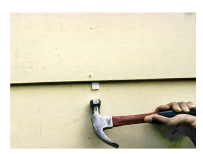
Photograph 4: Wedgie —So simple and so obvious. After the problem is understood. Wedges created gaps that reduced capillary uptake of surface water, promoted drainage and back ventilation.

Photograph 3: Wet Cladding —Problems with mold and decay were worse on north and east elevations. Problems with peeling paint were worse on west and south elevations. Solar radiation cycled the cladding moisture content more on the west and south elevations stressing the paint. UV cross-linked the paint making it less flexible. Less flexibility, more movement on the south and the west led to the peeling paint. Less energy on the north and the east led to the mold and the decay.