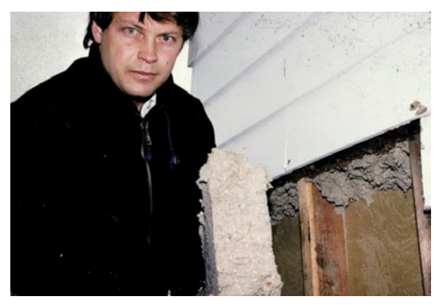
Photograph 2: Retrofit Cellulose Cavity Insulation— Dry blown cellulose packed into exterior wood frame walls. Injected from the exterior at top of cavity. This author, very young at the time, amazed at how well the insulation worked. Cavities were dry when opened.

attached to it—called a humidifier. How things have changed.