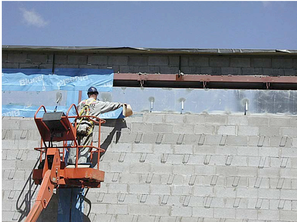
Figure 5. Achieving airtightness requires attention to detail at all transitions and penetrations from design through construction.

Airtightness targets are useful during the design process for new buildings as well as retrofits—they establish quantitative expectations for a very important aspect of building enclosure performance and provide a key input into the mechanical designer's load and energy calculations. Airtightness tests should therefore be an important part of the construction process—they provide confirmation that airtightness targets are met and, if timed properly, afford the opportunity to address problems before it is too late.