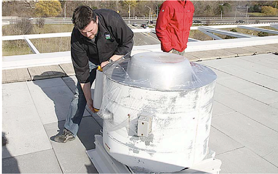
Figure 2: Sealing an intentional opening on the roof of a building during test set-up.

For larger buildings, that is, with a floor area of over about 10, 000 ft 2 (929m 2 ), this test method usually requires numerous co-ordinated blower doors running at the same time. In some cases, large mobile fans requiring trailers and external power sources have been used. In all cases, large or small, a building must be prepared for testing beforehand by blocking intentional openings such as HVAC intake and exhaust grills, kitchen and bathroom exhaust fans, relief dampers, etc. ( Figure 2 ). Sealing intentional openings is usually the part of the testing that takes the most time and effort.