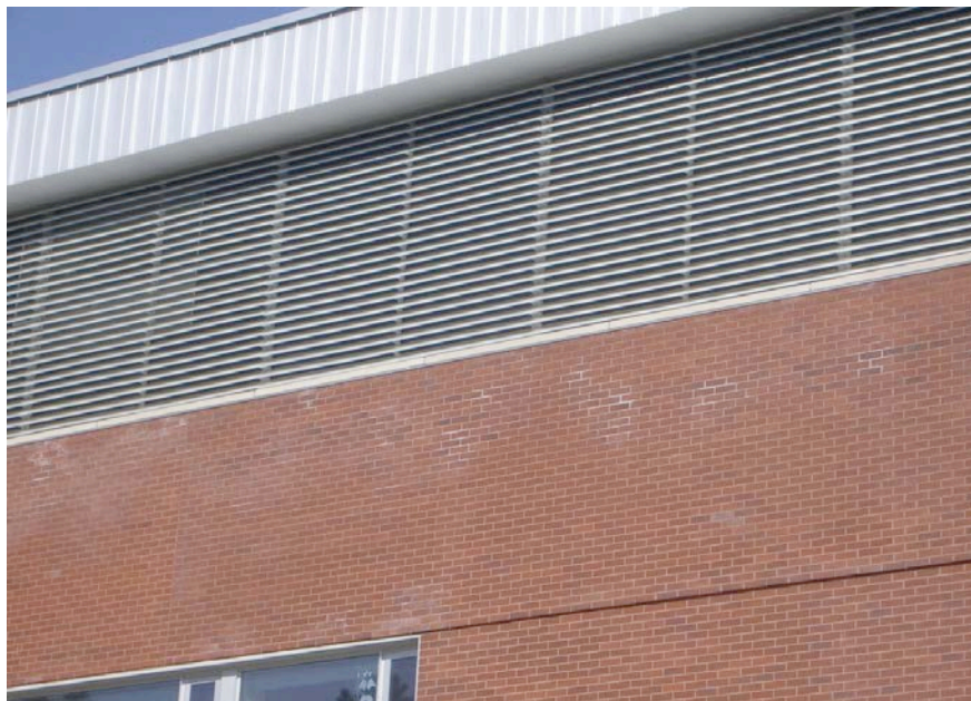
Figure 4: As vents and grilles can make up a large area on many commercial buildings, the management of uncontrolled air leakage must also be considered.

and that means we have to worry more about backflow dampers that actually act as backflow dampers should—that is, they should seal tight in the closed state—because this will matter to the overall tightness of the building in service. In one test, a constant pressure of -75 Pa was maintained while the coverings of the mechanical systems were systematically removed. As soon as the return air vents were opened, there was a 41% change in flow. By the time everything was opened, the flow rate was 5.46 m 3 /s (11575 cfm), a 67% increase from the base rate. What this tells us is that for buildings that are already quite airtight, where it would be difficult to make further improvements through changes to the enclosure, airtightness can still be improved by fixing those mechanical leaks, for example by ensuring that supply vents in the HVAC system are actually sealed during off-cycle times with better gaskets, tighter actuators, and proper damper adjustments.