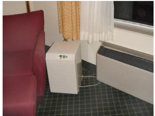
Photograph 6: Hotel Room Fix —The through-wall unit controls the temperature (the "sensible" system). The dehumidifier controls the humidity (the "latent" system).

Guess where this technology is now making an impact—condos and apartments. Small houses are next. We are already separating the latent from the sensible on most commercial design—after all it is the sensible thing to do.