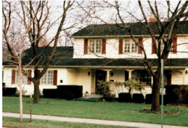
Photograph 1: The “Typical House” —Built in 1965 in Cleveland, OH with no cavity insulation in the exterior wood frame walls. No problems for twenty years. Insulation added to exterior walls in 1985 and within one year the paint begins to fail.

Well what changed? We've begun to insulate—and insulate exceptionally well—and we're getting the assemblies “tighter” to air change and convection. That results in two things—less energy exchange therefore less drying potential—and things on the exterior side of the enclosure are colder in the winter. Things being colder on the outside lead to something most folks don't consider. Many building materials are hygroscopic ( Figure 1 ). This means they absorb moisture based on relative humidity. Even more strangely, they don't care