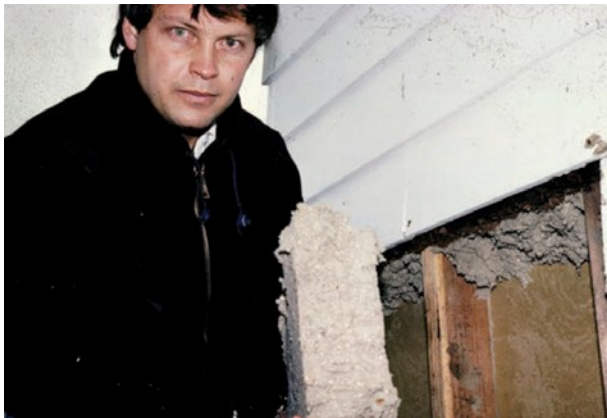
Photograph 2: Retrofit Cellulose Cavity Insulation —Dry blown cellulose packed into exterior wood frame walls. Injected from the exterior at top of cavity. This author, very young at the time, amazed at how well the insulation worked. Cavities were dry when opened.

about vapor pressure except if it affects relative humidity. This is a big deal. In fact it is a huge deal.