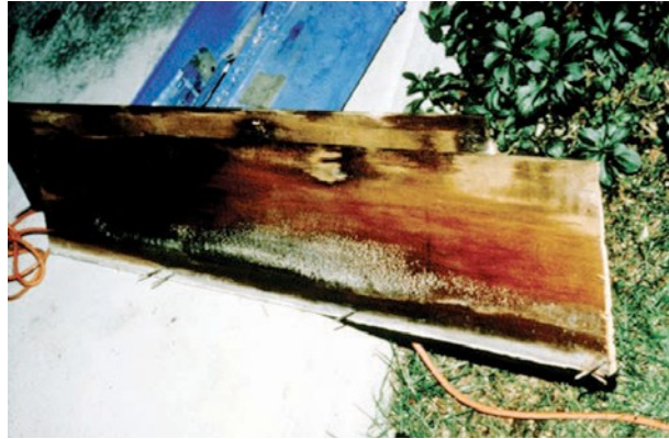
Photograph 3: Wet Cladding —Problems with mold and decay were worse on north and east elevations. Problems with peeling paint were worse on west and south elevations. Solar radiation cycled the cladding moisture content more on the west and south elevations stressing the paint. UV cross-linked the paint making it less flexible. Less flexibility, more movement on the south and the west led to the peeling paint. Less energy on the north and the east led to the mold and the decay.