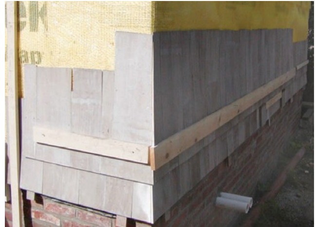
Photograph 5: Drainage and Ventilation Matt Behind Cladding —This is easy for new construction and re-cladding. Existing buildings are going to be a problem. Don't say you weren't warned.

heat (energy) has to be added back to the air. Traditionally this heat (energy) was available through