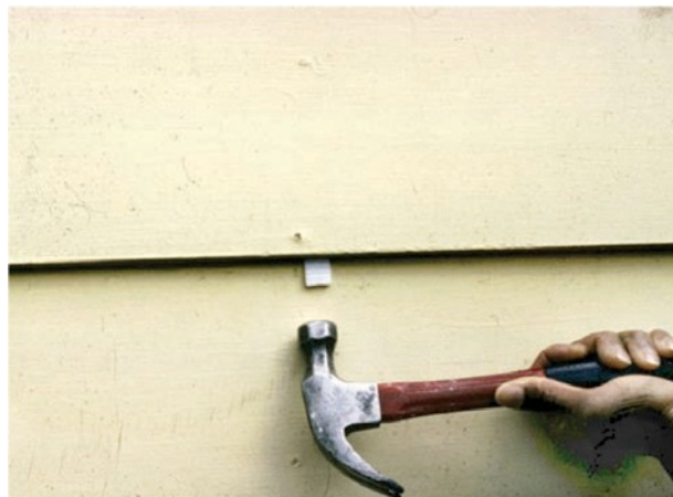
Photograph 4: Wedgie —So simple and so obvious. After the problem is understood. Wedges created gaps that reduced capillary uptake of surface water, promoted drainage and back ventilation.