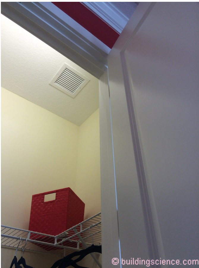
Photograph 3: Closet Ventilation - The best way to provide closet ventilation is to install a small return air duct in the closet.