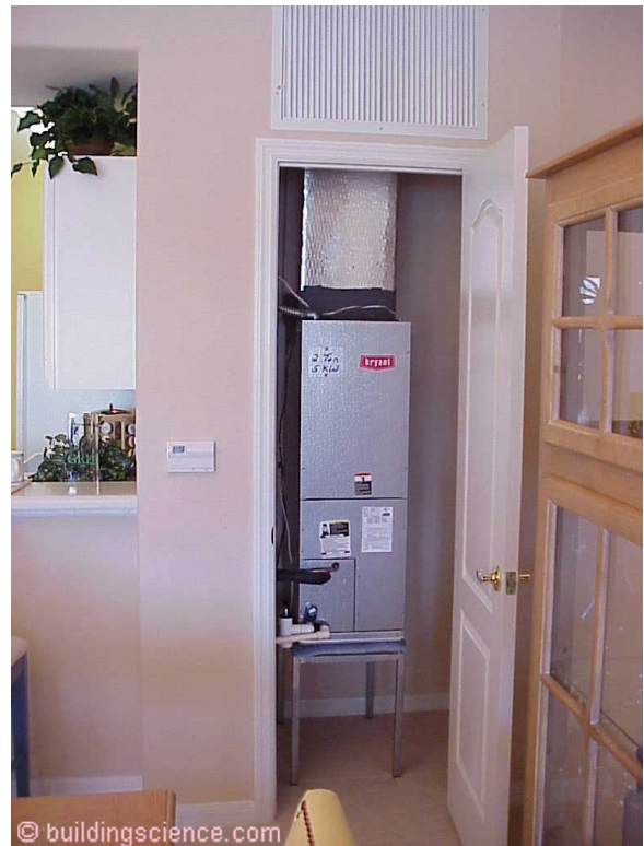
Photograph 6: Closet as Return Plenum – All the return air comes into the closet through the large transfer grille above the door. The closet is the “mechanical closet”.

Weird, eh? You can take “all” the return air out of a mechanical room closet with a large return transfer grille (Photograph 6) or louvered door (Photograph 7)...but you can’t take a little bit of return air from a closet with an undercut door or a transfer grille.