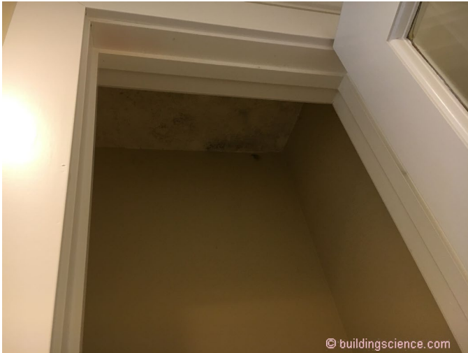
Photograph 2: Mold in Closet - We now get mold inside the home at closet ceilings. When we couple the colder closets with higher levels of ventilation air you need to add supplemental dehumidification or you have to provide closet ventilation or both. Sure would be nice if sales and marketing would let us go back to louvered closet doors.