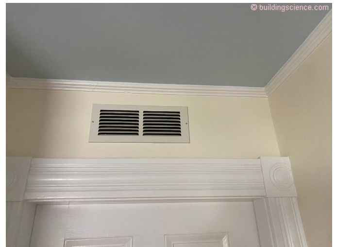
Photograph 5: More Transfer Grille – Don't forget undercutting the door.

What about just installing transfer grilles and undercut doors and no “active” return? It does not work consistently enough. The approach works in marine climates and mixed dry climates but not consistently enough in hot humid and mixed humid climates. Here is where I point out that louvered doors do work consistently enough...but I don't win that argument because apparently I have no “taste” or sense of “interior design, look or style”. It is tough being an engineer 3 .