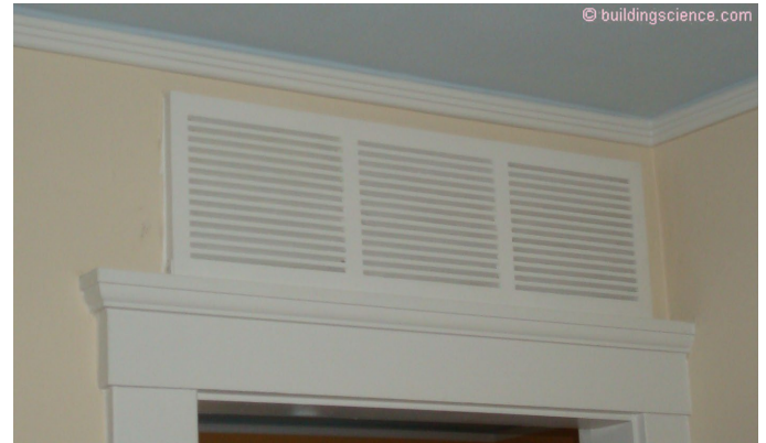
Photograph 4: Transfer Grille – Couple transfer grilles with undercut doors to equalize the temperature and pressure between the closet and the rest of the house.