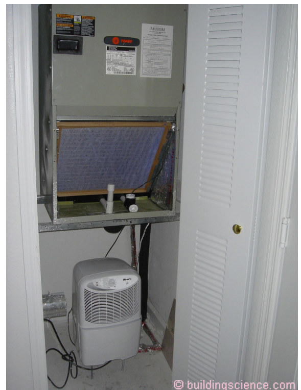
Photograph 7: More Closet Return Plenum – All the return air comes through the louvered bifold door. Note the “stand-alone” dehumidifier in the “return closet” providing part load humidity control.