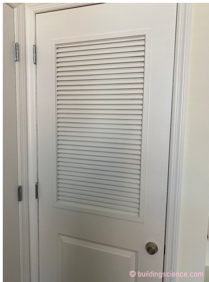
Photograph 1: Louvered Door -The air circulation provided by the louvered door will carry heat into the closet, warming the closet and reducing its relative humidity. Unfortunately, lots of folks do not like the look of louvered doors.

What happens when you increase attic insulation from R-30 to R-38? Or to R-49? Wait for it...your ceiling gets colder.... Don't you just love this? Yup, the attic insulation does its job. The load from the attic is reduced. Now couple this with higher dewpoint temperatures at the underside of the ceiling. Where do the higher dewpoint temperatures come from? Ah, we were here before....a couple of times....part load humidity, higher ventilation rates and way more thermal efficiency (BSI-006: No Good Deed Shall Go Unpunished, July 2016 and BSI-109: How Changing Filters Led To A Condensation And Mold Problem, December 2018).