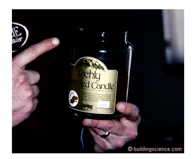
Photograph 3: Candles – Problems with candles...especially the scented/aromatic ones...ah, ambience and decoration.

Photograph 2: Brownian Motion - "Ghosting" of framing members on the interior gypsum board surfaces of exterior walls.