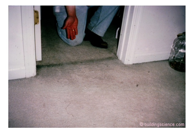
Photograph 1: Carpet as a Filter - Discoloration of carpeting due to particulate accumulation.

The issue kind of went away...for a while...and now is back...with heat pumps. Huh? Time to set things up a bit so sit back and read on.