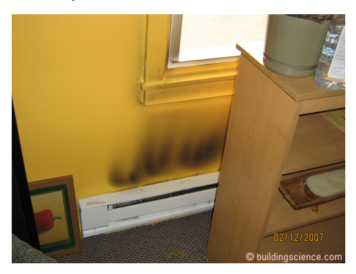
Photograph 6: Electric Resistance Baseboard Heaters – What a mess... an energy efficient respirable particle generator.

Figure 1: HVAC System Pressures – Typical pressure difference between bedrooms and common areas in houses with forced air distribution systems.