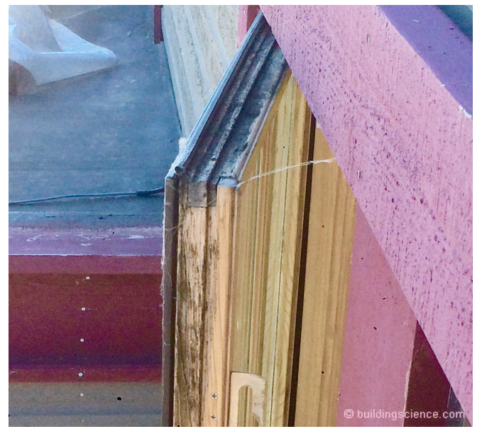
Photograph 2: Residential Window – Don't have a window in your grow room.