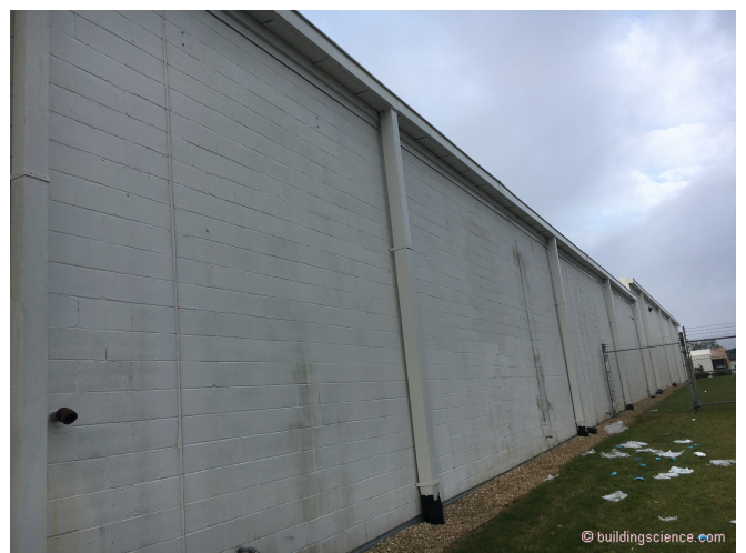
Photograph 5: Grow Op Warehouse - Taking industrial buildings and warehouses and converting them to grow operations is not easy and not without its problems. You really think you can do this in an uninsulated masonry of metal building?

Let's go back to the optimum temperature and relative humidity conditions for growing weed. Does this not sound just like a museum or art gallery? Typical museum specifications are 75 degrees F. plus or minus 5 degrees and 50 percent RH plus or minus 5 percent. Except with a museum we want things to be constant. Not so for the marijuana business. Closely held trade secrets now come to play. Differing conditions between light and dark...differing conditions between growth cycles and flowering cycles. Grow operations want things to react quickly and precisely. Can't do that commercially on a large scale in a leaky building enclosure with little or no insulation and lots of thermal mass. More about that later. But the point is made...you are going to have to have insanely big mechanical systems that are going to try to regulate differing temperature and humidity goals that may be shifting on an hourly basis...unless you are smart with the building enclosure.