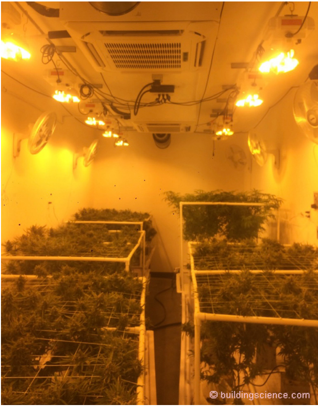
Photograph 4: Commercial Grow Operation – Humidified, pressurized, temperature controlled, carbon dioxide injected, lighted, circulated....easy right?

Commercially, taking industrial buildings and warehouses and converting them to grow operations ( Photograph 4 and Photograph 5 ) is not easy and not without its problems. You really think you can do this in an uninsulated masonry or metal building?