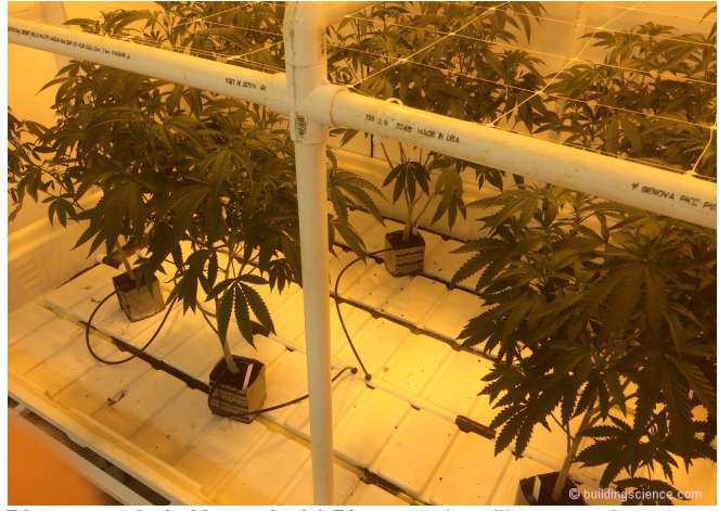
Photograph 1: Household Plants – Just like any other plants...hah!