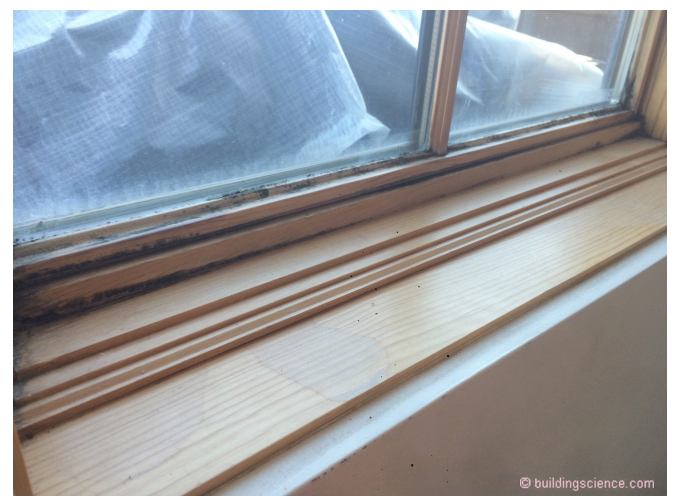
Photograph 3: Residential Window – Did I already mention don't have a window in your grow room.